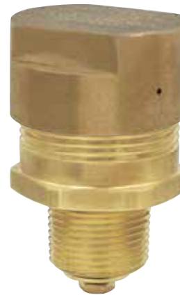
7590U with Cap